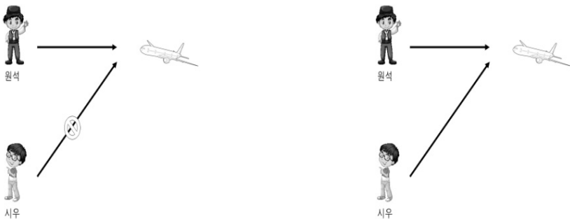
[Figure 1] Picture Stimuli in the Strict Reading Priming Condition

The example of pictures presented in the sloppy reading priming condition is shown in Figure 2. The sentence presented to the participants in the sloppy reading priming condition is the same sentence presented in the strict reading priming condition. Thus, the priming sentence in (5) was presented in the sloppy reading priming condition as well. However, unlike in the strict reading priming condition, in the sloppy reading priming condition, participants were given a pair of pictures each of which includes two object images. The left picture in Figure 2 means that Wonsek did something to an airplane, but Siwu did not do something to another airplane . Similarly, the right picture in Figure 2 indicates the situation in which Wonsek did something to an airplane and Siwu also did something to another airplane . Participants were supposed to choose the right picture among the