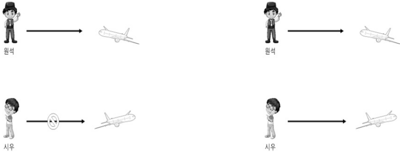
[Figure 2] Picture Stimuli in the Sloppy Reading Priming condition

two pictures since the left picture does not match the priming sentence in (5). Thus, participants were forced to connect the right picture and the priming sentence, which would lead participants to interpret the priming sentence in the sloppy interpretation.